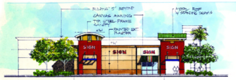
SOUTH ELEVATION SCALE: 1/8" = 1'-0"