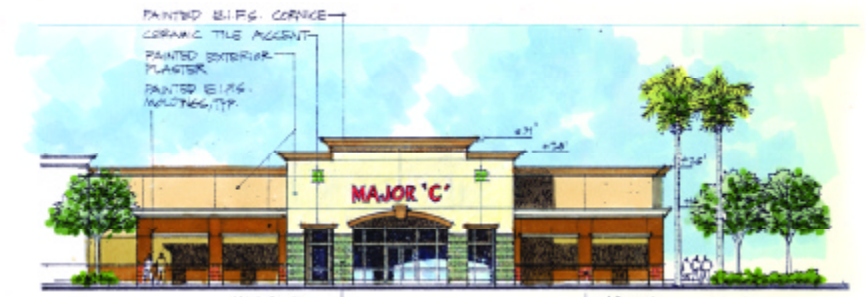
EAST ELEVATION SCALE: 1/8" = 1'-0"