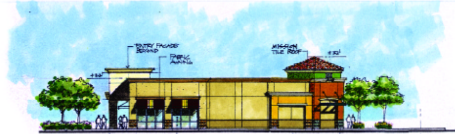
SOUTH ELEVATION SCALE: 1/8" = 1'-0"