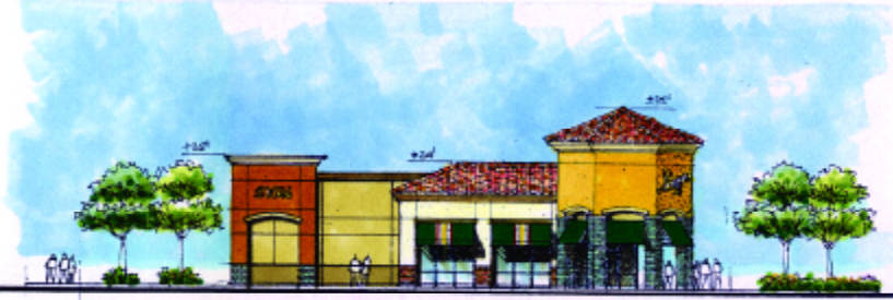
NORTH ELEVATION SCALE: 1/8" = 1'-0"