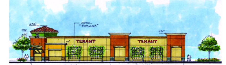
EAST ELEVATION SCALE: 1/8" = 1'-0"