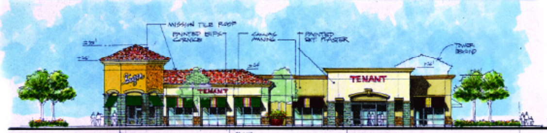
WEST ELEVATION SCALE: 1/8" = 1'-0"