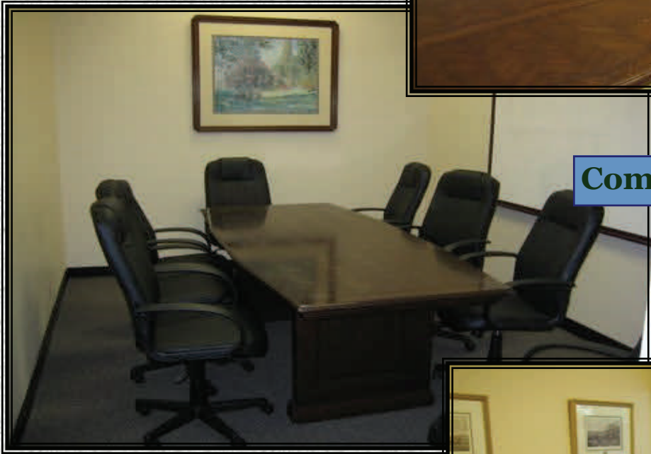
Common Conference Room