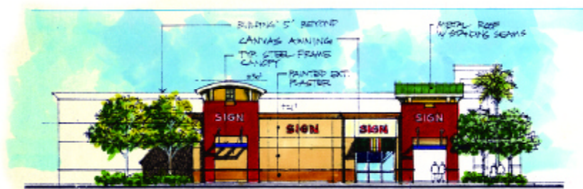
SOUTH ELEVATION SCALE: 1/8" = 1'-0"