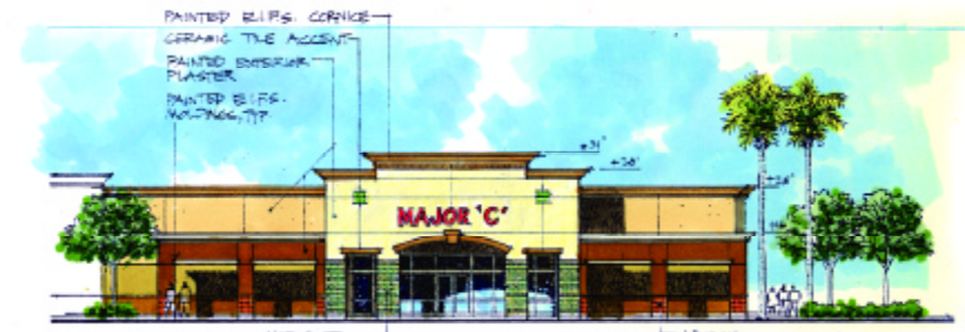
EAST ELEVATION SCALE: 1/8" = 1'-0"